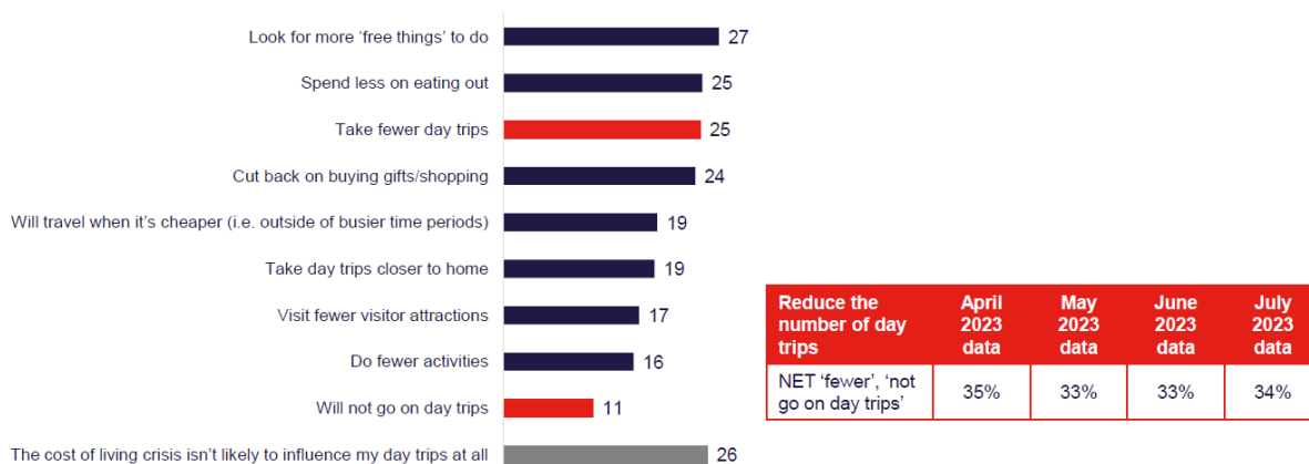
Figure 13b. 'Cost of living' impact on day trips, Percentage, July 2023, UK, Full list

Question: VB7Cii. How, if at all, would you say the 'cost of living crisis' is likely to influence your day trips in the next few months? Base: July 2023 = 1,755.